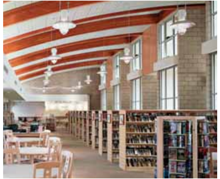
Lake View Terrace Library. Lake View Terrace, California, USA. Architect: Fields Devereaux Architects & Engineers. Electrical engineer: Fields Devereaux Architects & Engineers. Sustainable Design Consulting and Commissioning: GreenWorks Studio.