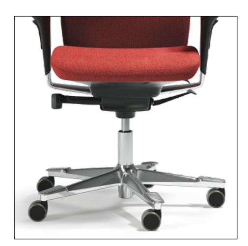
ALUMINIUM FIVE-STAR BASE The White Edition, Silver Edition and Polished Edition are fitted with aluminium star bases.

The 5-star base is stylish and ergonomically designed with well-marked support for the feet. By resting your feet on the star base, you take the pressure off the back of your thighs to create a restful position. The Black Edition model is fitted with this base.