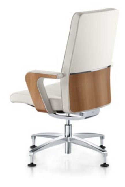
Conference swivel chair, 4-leg model with felt or plastic glides.