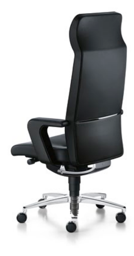
Executive swivel chair with high backrest and integrated headrest with "independent fit" technology.