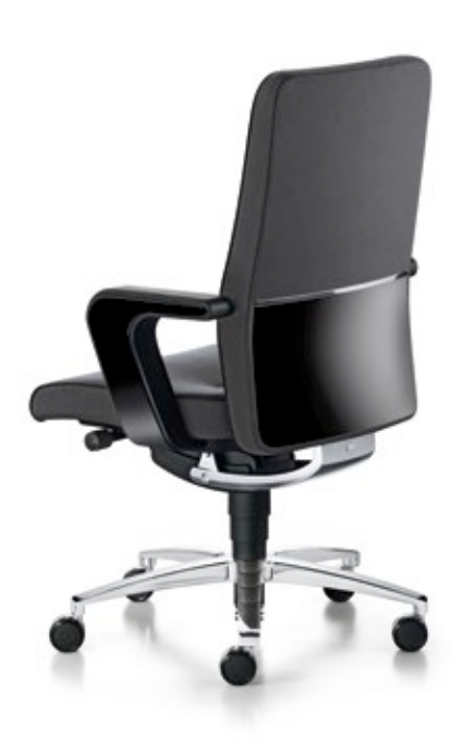
Executive swivel chair with medium backrest and castors for soft or hard floors.