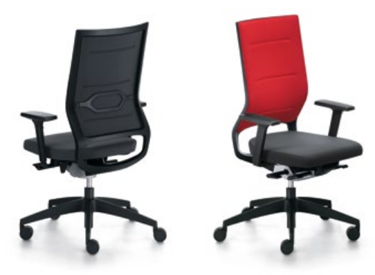
Swivel chair with slim upholstery backrest, height-adjustable lumbar support, height-adjustable armrests, black plastic base