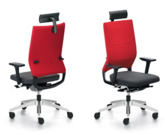
Swivel chair with fully upholstered backrest, headrest, height-adjustable lumbar support, 3D adjustable armrests, polished aluminium base