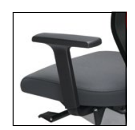
Basic armrests. Height-adjustable.