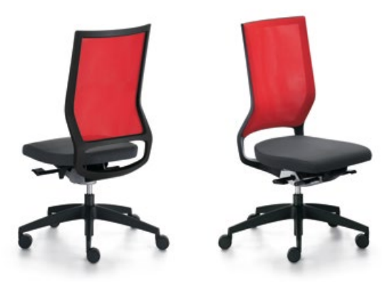
Swivel chair with membrane-covered backrest, black plastic base