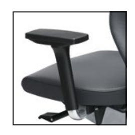
Polished connection to go with polished aluminium base.