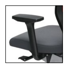
3D adjustable armrests. Adjustable height, width and depth, with Softtouch finish.