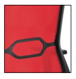
Sitting healthy can be so comfortable. Height-adjustable lumbar support with mesh and slim upholstered versions.

Comfortable, spacious and yet with remarkable lightness – the Sedus quarterback combines timeless design with perfect ergonomics. The armrests striving towards the front underline the dynamic expression of the side line and highlight the high level of seating comfort. A quality that is complemented by sophisticated technology and individual customisation options. All three types of upholstery to choose from for the backrest not only support the back, but also enhance the elegant appearance.