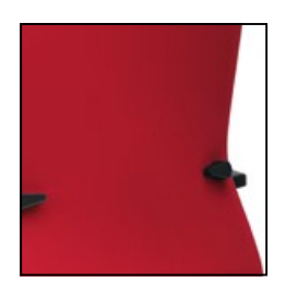
Height-adjustable lumbar support, integrated into the backrest of the fully upholstered version.