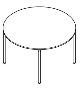
544/00 Round, Diameter 126 (495/8"), H 73 (28<sup>3</sup>/<sub>4</sub>")