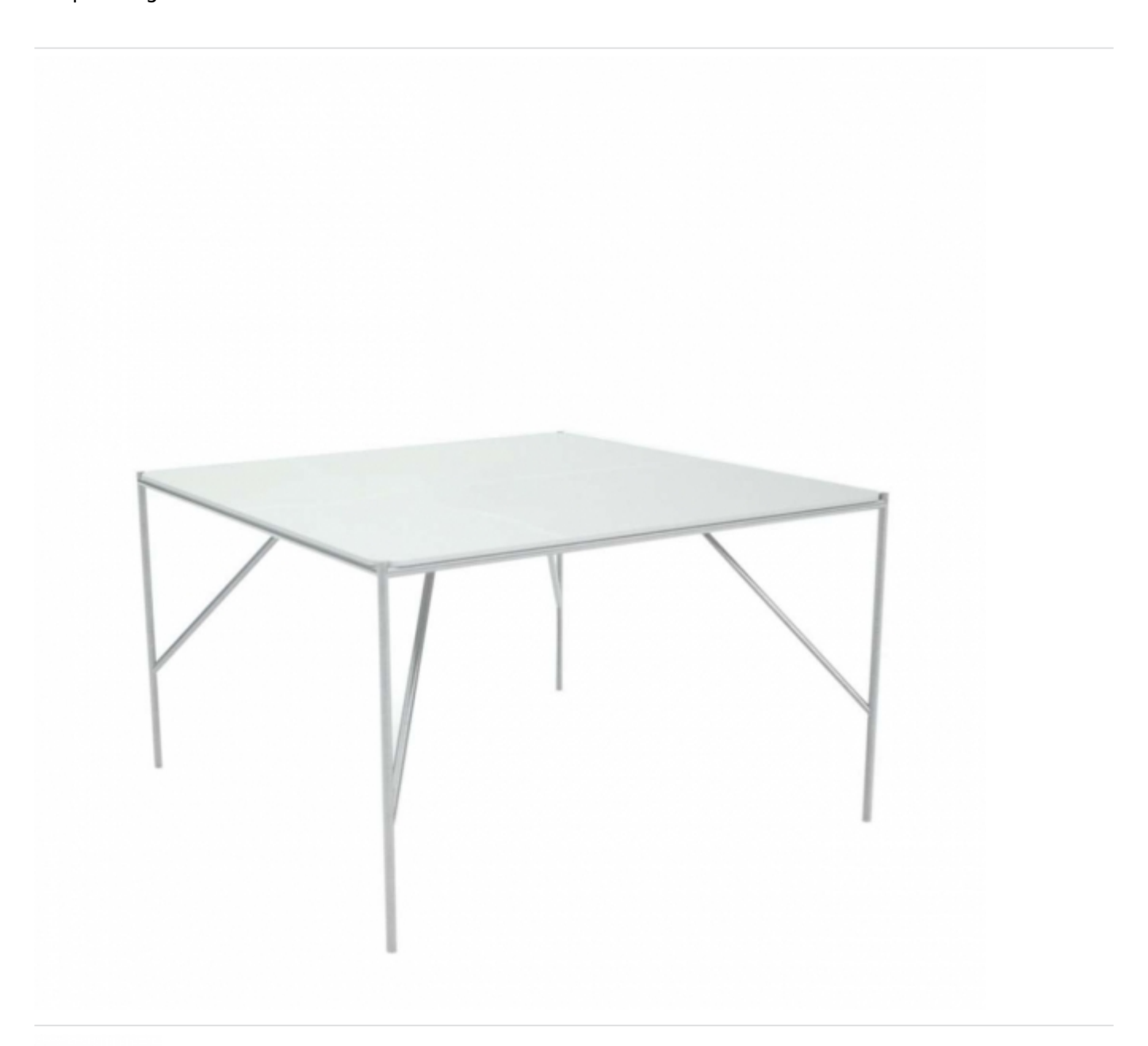
Table with structure in stove enamelled steel. Top in Full-Color plywood, satin-finished or white lacquered glass.