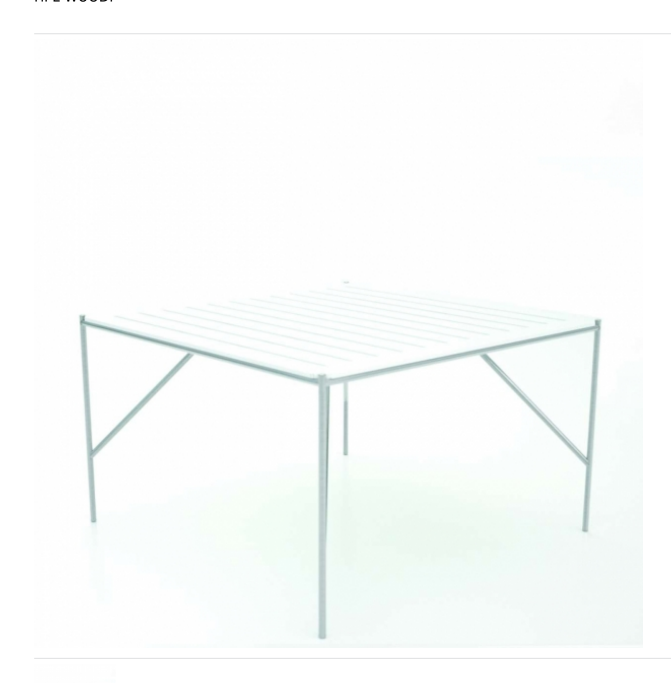
Table with bearing structure in brushed stainless steel 316. Top in white Full-Color plywood or HPL-WOOD.