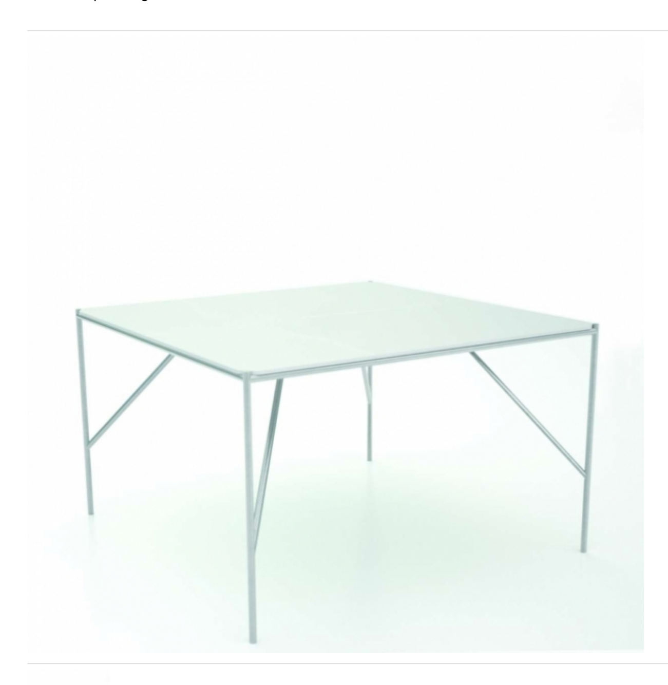
Table with structure in brushed stainless steel 316. Top in white Full Color plywood, satin-finished or white lacquered glass, Full Color milled or HPL-WOOD milled.