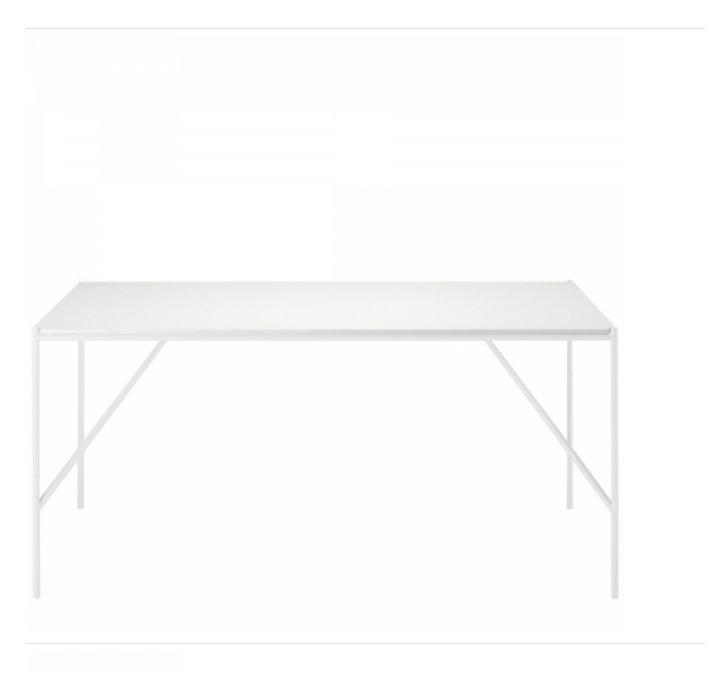
Table with structure in stove enamelled steel. Top in Full-Color plywood, satin-finished or white lacquered glass.