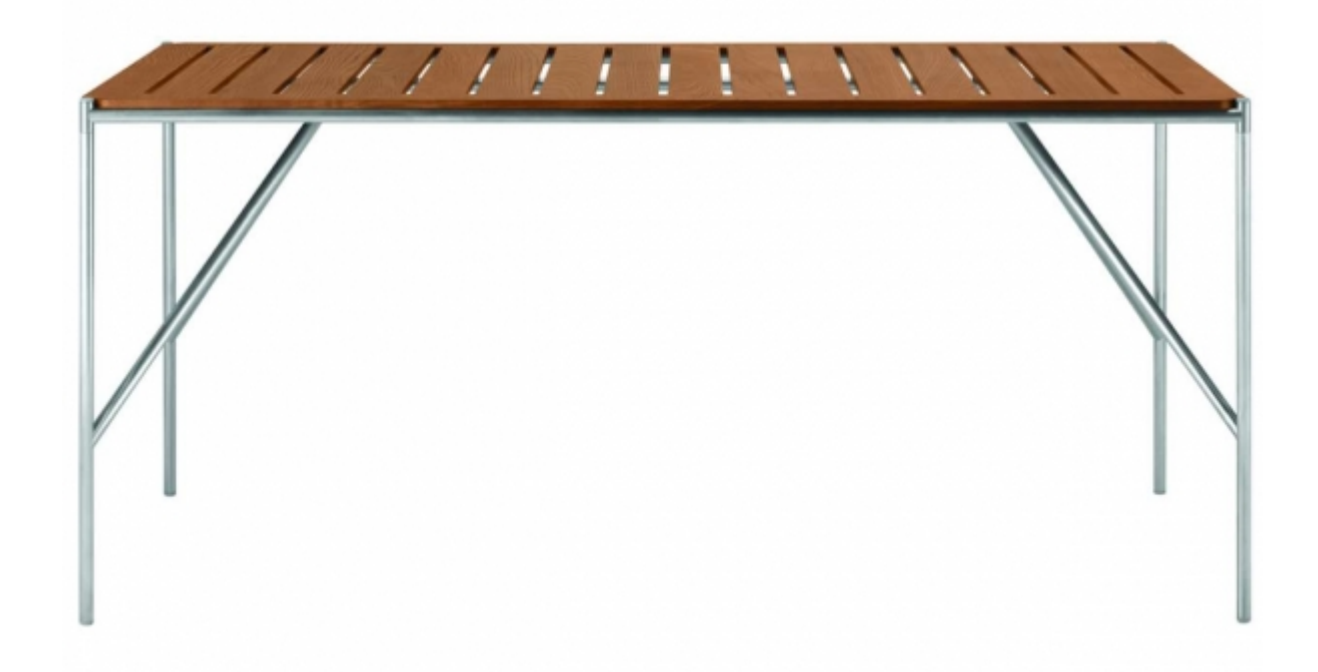
Table with bearing structure in brushed stainless steel 316. Top in white Full-Color plywood or HPL-WOOD.