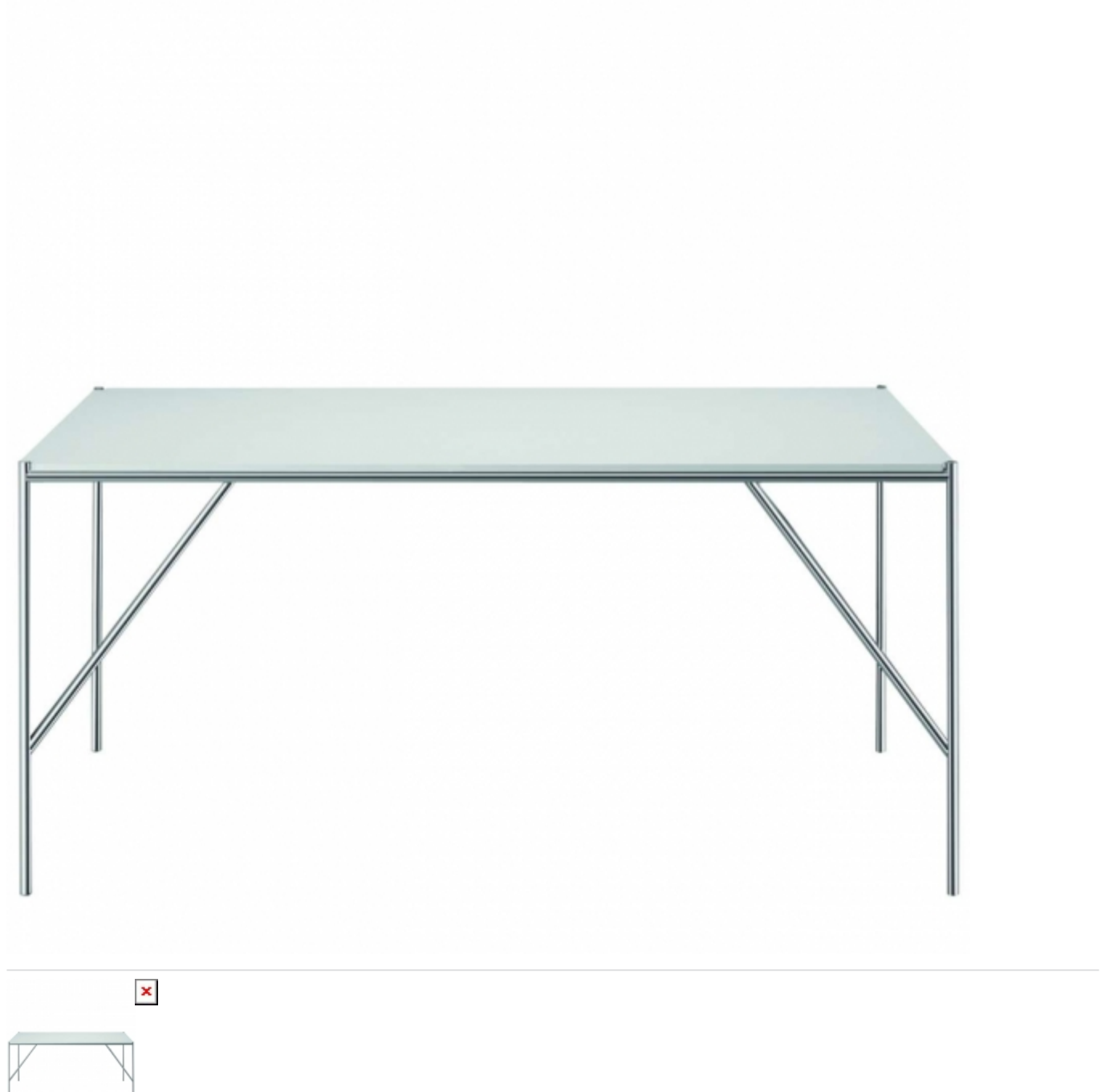
Table with structure in brushed stainless steel 316. Top in white Full Color plywood, satin-finished or white lacquered glass, Full Color milled or HPL-WOOD milled.