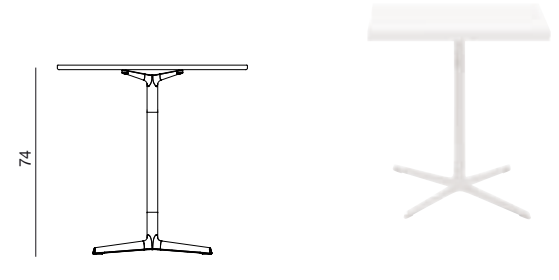
Table with four-star base in shiny aluminium or painted and top in white, embossed MDF, available in different shapes and sizes (square, round). Height 74 cm.