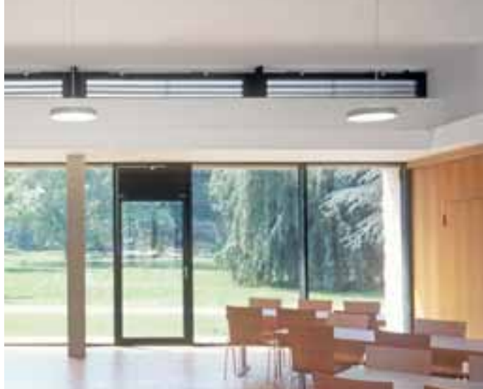
Familienzentrum. Offenburg, Germany. Arkitekt: K9 Borgards-Lösch-Piribauer. Lighting designer: Vertec Ettenheim.