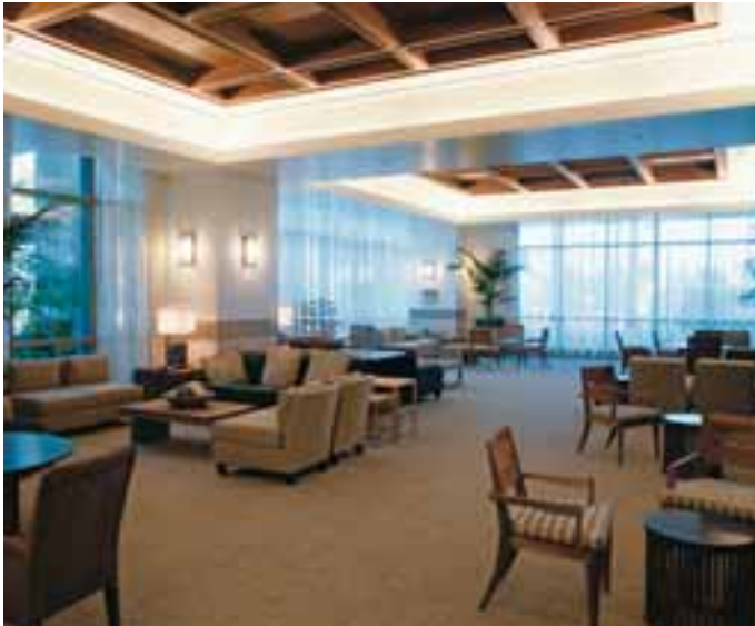
Hoag Hospital - Sue & Bill Gross Women's Pavilion. Newport Beach, California, USA. Architect: Taylor + Associates Architects. Engineer: RE Wall & Associates, Inc. Lighting designer: Francis Krahe & Associates Inc.