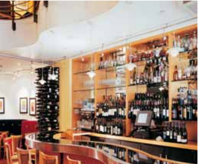
Morrell Wine Bar. New York, New York, USA. Architect: Space Design.